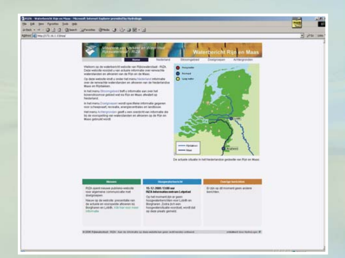
The opening page of 'www.waterbericht.nl (water message) with warnings and messages

Examples of cut to size information are navigation depths (Shipping), water temperature (Electricity supply), time of flooding of the floodplains (Agriculture, Nature management, People living in the neighbourhood of the rivers).