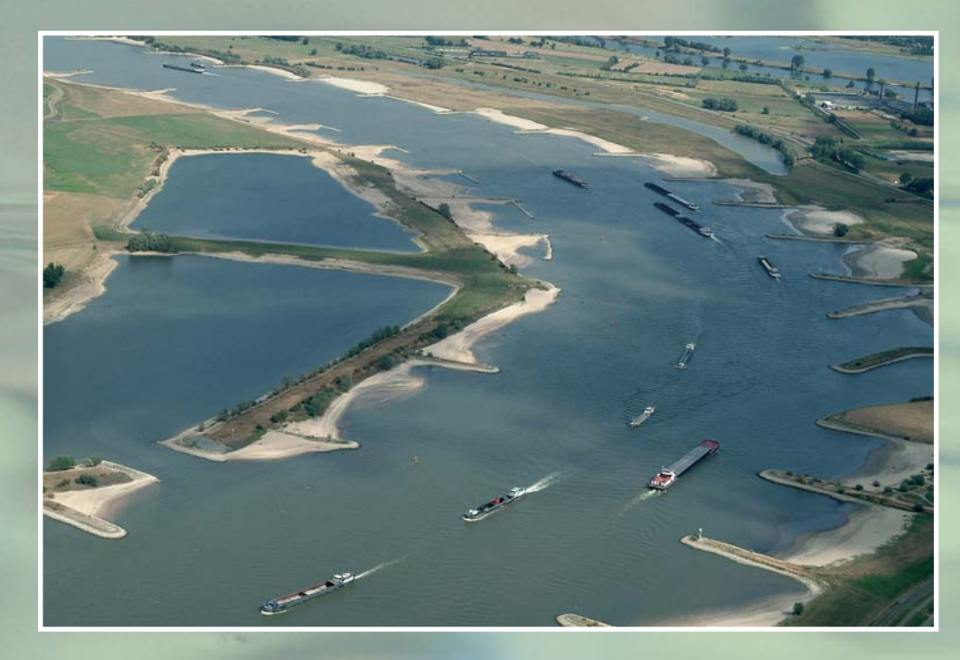
The Rhine during low discharges